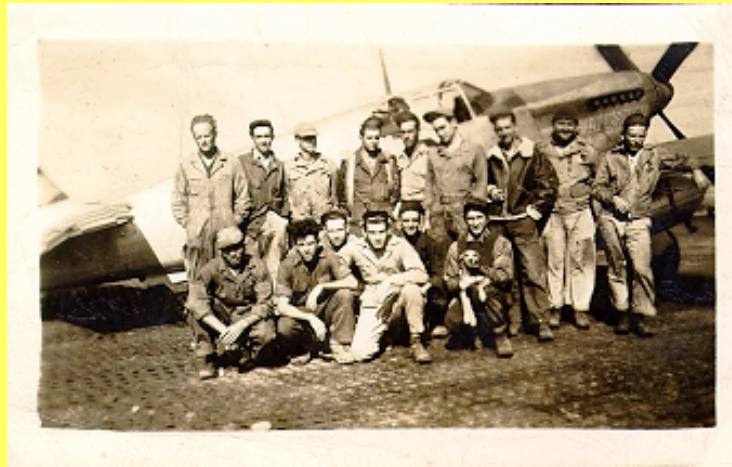
Group Photo in front of a P-51B