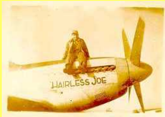
P-51D named Hairless Joe

This was the second of 2 P-51's to carry the "Hairless Joe" name.