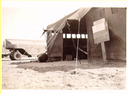
319th FS Operations Tent, North Africa